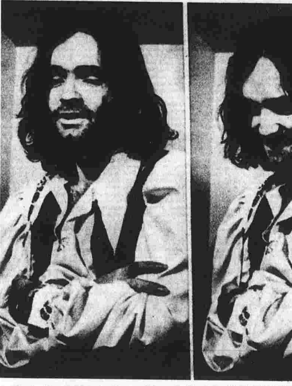
Charles Manson seemed self-assured even in this photo after his arrest in winter.