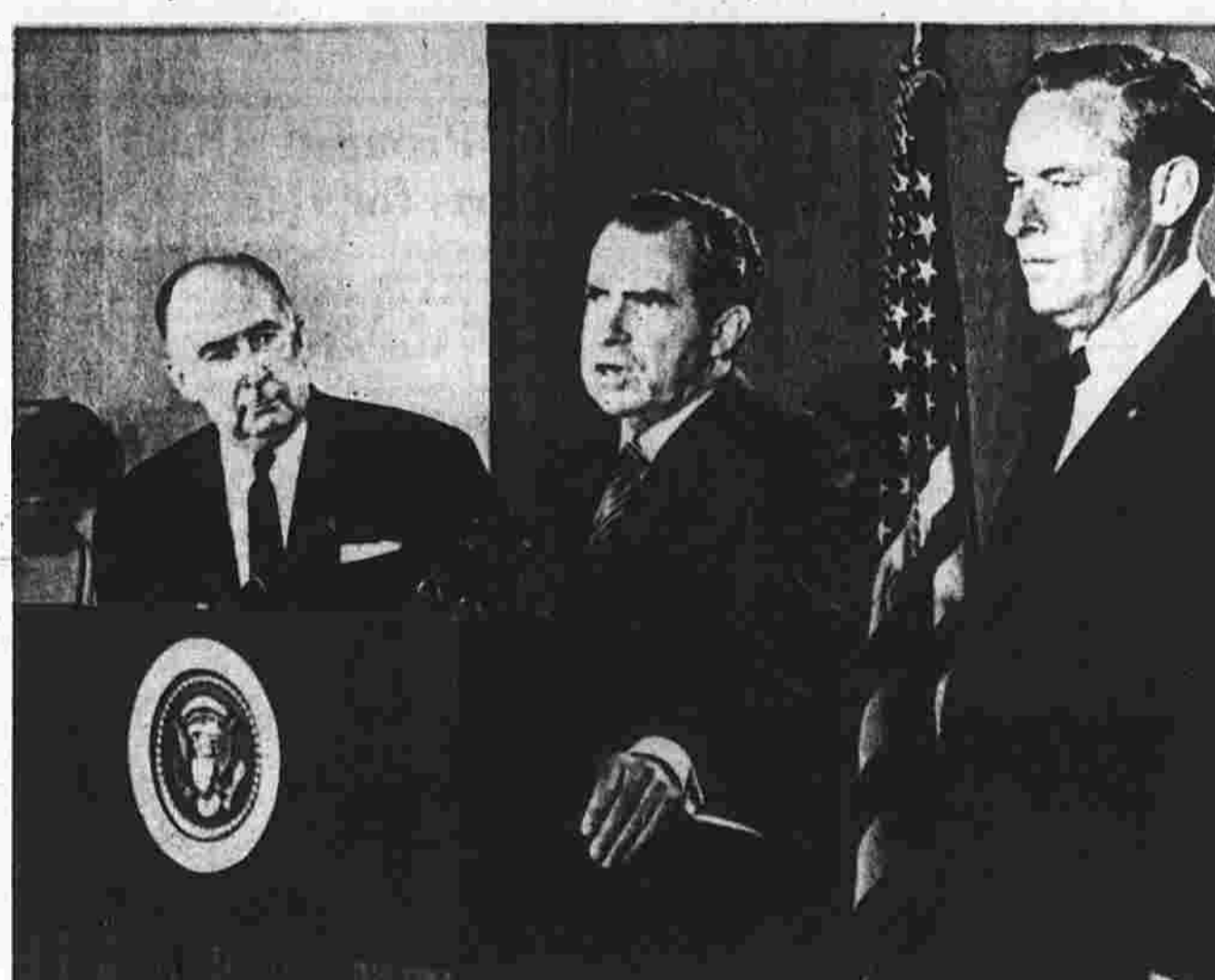
President Nixon is flanked by Colorado Gov. John Love, right and Atty. Gen. Mitchell as he delivers statement on the Manson murder trial.